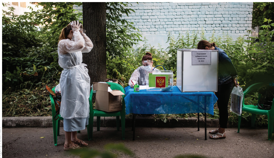
Left: One of many makeshift polling stations set up throughout Russia to allow people to vote in the July 2020 plebiscite, which took place during the Covid-19 pandemic.